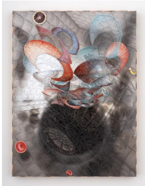
Being the best in the unknown zone