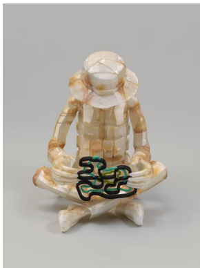
Child Soldier Examining Fun Shape 2020 PLA plastic, wood 36" H x 32" W x 33" D