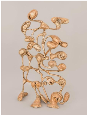
Screen 1 2021 Plywood, coating 84" H x 43" W x 22" D

30 Orchard St, Gallery 1 ▪ Sept 9 - Oct 10, 2021