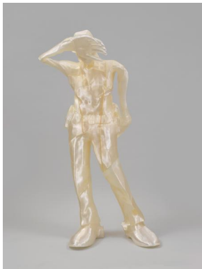
True Detective Staring at the Sun 2021 PLA plastic, aluminum 55" H x 24" W x 22" D