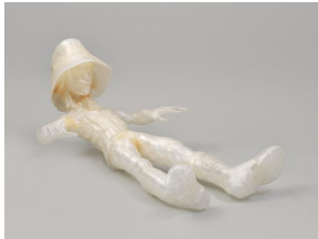
Beekeeper Staying Fit 2021 PLA plastic, leather, wood 20" H x 42" W x 15" D