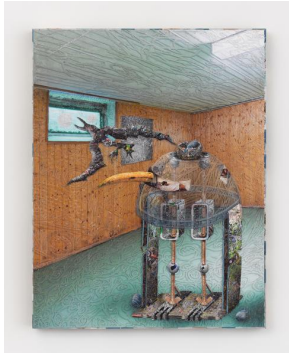
Paid surrogacy in her parent