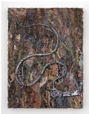
Back to Work 2021 Cut paper on panel 23" H x 17" W x 1" D