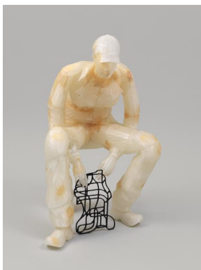
Security Guard, Resting