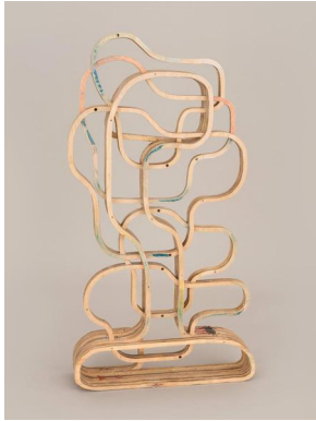
Screen 3 2021 Plywood, coating 64" H x 31" W x 7" D