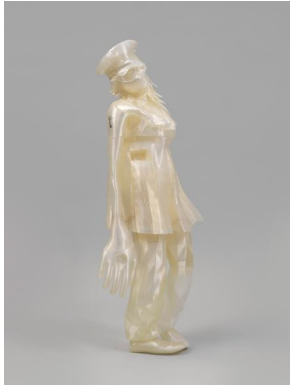
Good Cop Playing Coy