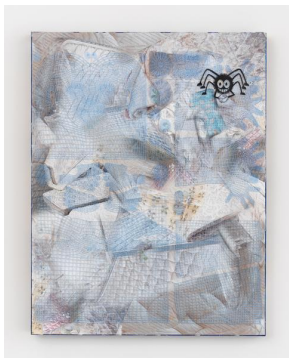
Weaving and eating and sleeping all night is a labor of love