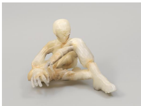
Hurry Up and Wait Soldier