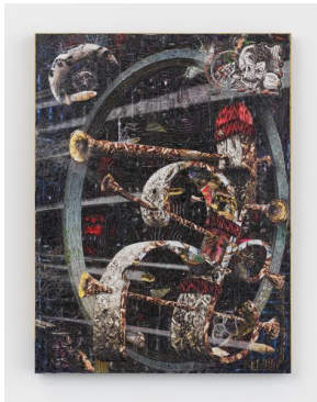
Defiant bullet dodger tellin' his story (reverse ergonomics)